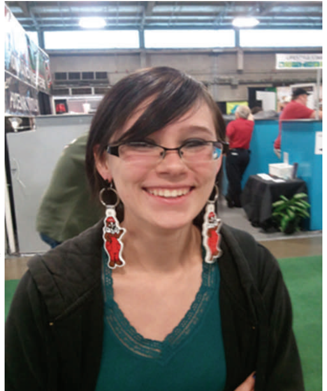
OKC Home & Garden Show