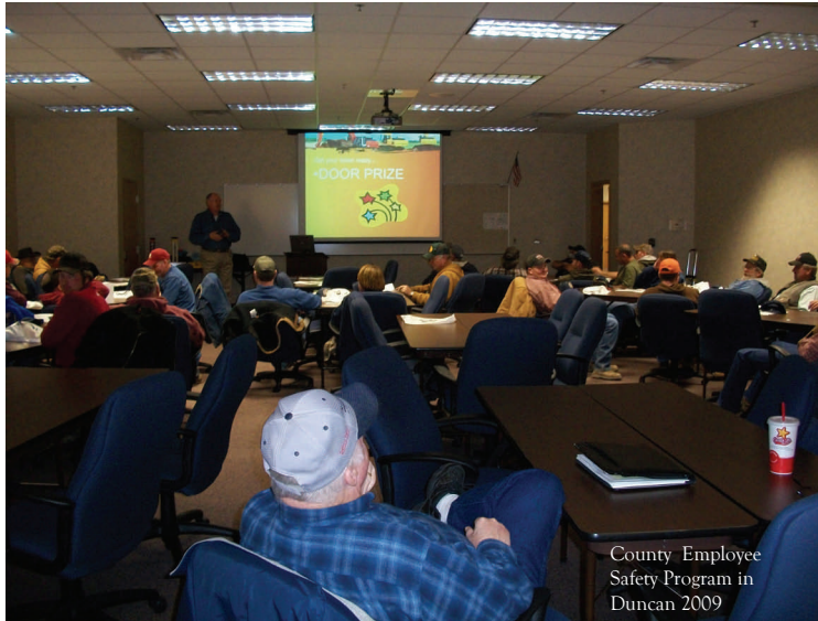
County Employee Safety Program in Duncan 2009

The schedule will be finalized in the upcoming months and will be available on the Call Okie website.